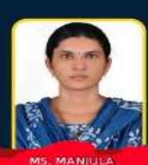
STATE RANK (NON-OT)